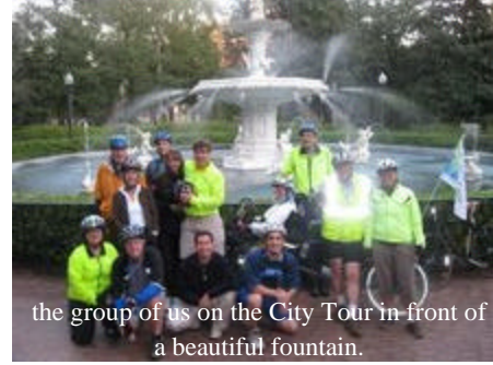
the group of us on the City Tour in front of a beautiful fountain.