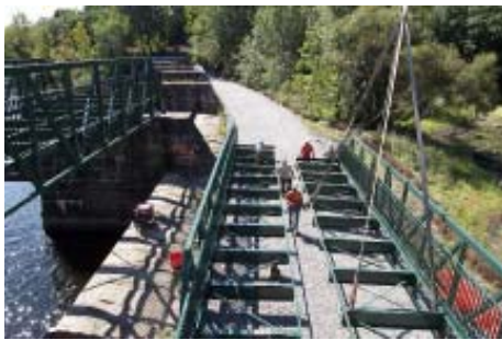
Workers complete the Pratt Bridge on the Blackstone River Bikeway.

Advancement of a critical piece of Maine's Eastern Trail via the granting by a private landowner to the Eastern Trail Alliance of an easement for three-quarter miles of trail west of the Nonesuch River in Scarborough, ME.